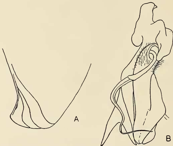
Fig. 1, A. Left side of collum of male. B. Left gonopod of male, with sternite, anterior view.

ing. Each somite with diameter greatest at caudal border, decreasing gradually forward excepting for the moderate depression between prozonite and metazonite. Segmental sulcus fine but sharply defined throughout.